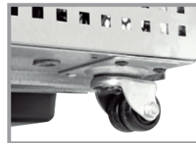
1 1/2" diameter dual swivel castors for "LP" models.