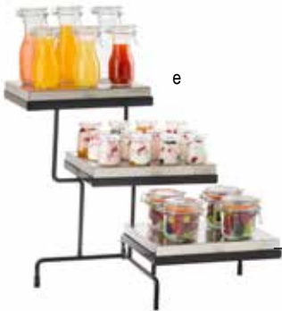
3-Tiered Half Size Cooling Display (CW40309B) Includes: (3) Half Size Cooling Plates and Black Powder Coated Stand