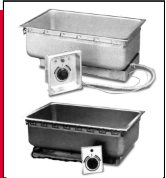
Top Mount Hot Food Well