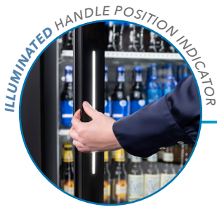
ILLUMINATED HANDLE POSITION INDICATOR