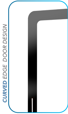
CURVED EDGE DOOR DESIGN

Swing Door Refrigerator with Hydrocarbon Refrigerant~Edge Glass Curved Version 01