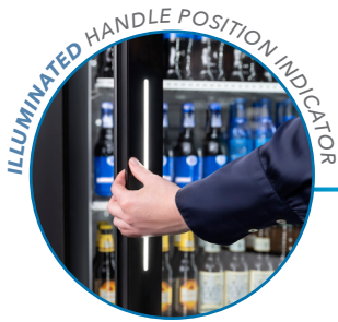
ILLUMINATED HANDLE POSITION INDICATOR