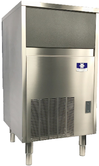
Model USP0100 CrystalCraft Ice Machine