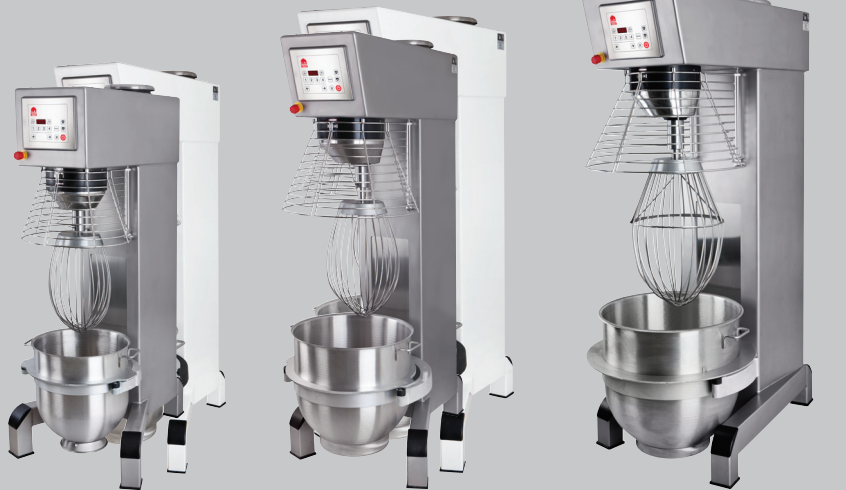
ERGO BEAR 60 Qt. ERGO BEAR 100 Qt. ERGO BEAR 150 Qt.