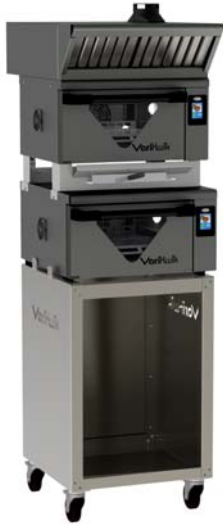
VK-VH Hood, 2 VK ovens, VK-SK Stacking Kit, VK-OS1 Oven Cabinet