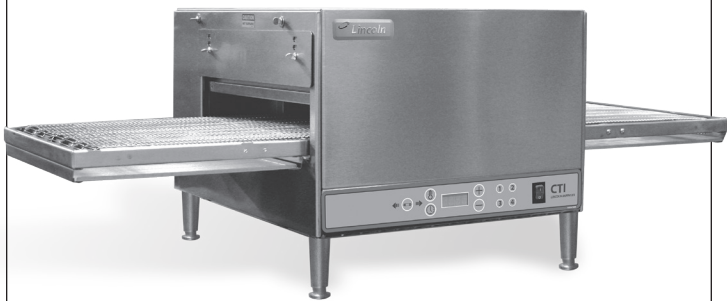
Shown with 50" (1270 mm) extended conveyor.