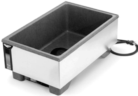
Model 1220 Full-Size Heat 'N Serve Merchandiser