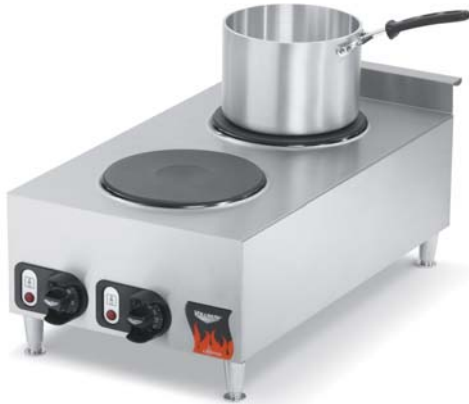
Cayenne® Electric Hot Plate