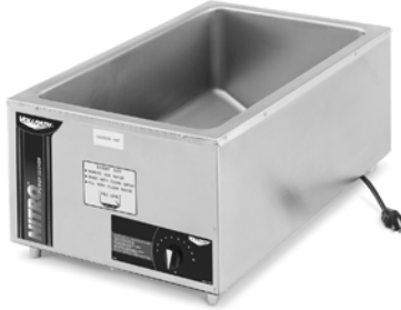
Nitro™ Power Rethermalizer