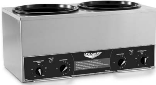
Twin 7 Quart Rethermalizer