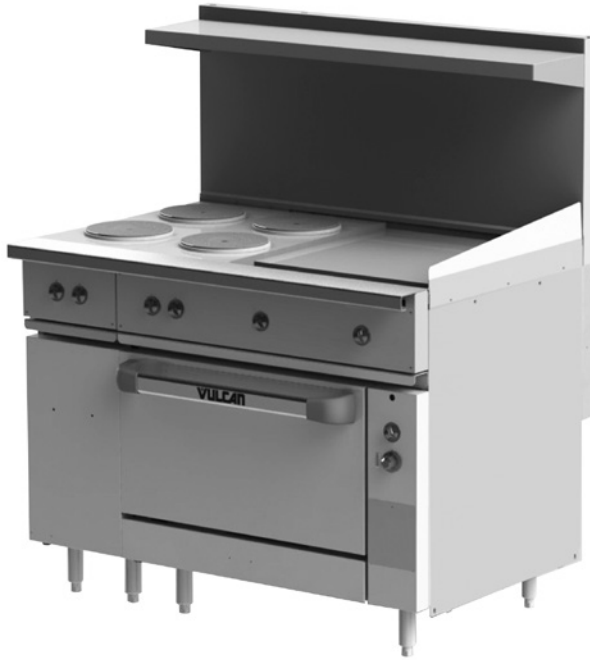
Model EV48S-4FP24G208 shown with adjustable legs