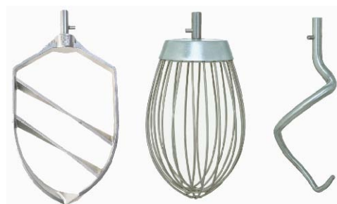
Standard tools: Stainless Steel flat beater, wire whip, and dough hook.