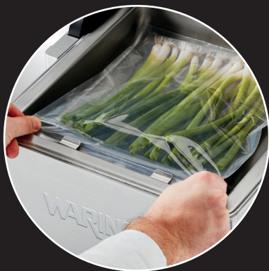
11" Seal Bar Double-seals Pouch