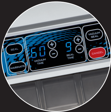
User-friendly, Easy-to-clean Touchpad Controls