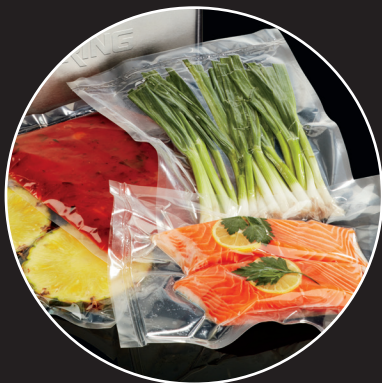
Package Fresh Meats, Soups, Marinades and Stews