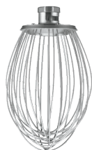
WSM20LW Stainless Steel Chef's Whisk