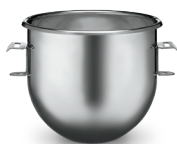
WSM20LBL 20-Quart Stainless Steel Bowl

Special shipping requirements needed. Machines ship in large wood crates via courier service.