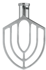
WSM20LMP Aluminum Mixing Paddle