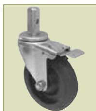
ALRC-5STK 5" caster with brake