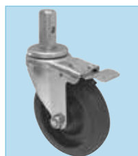
ALRC-5STK 5" caster with brake