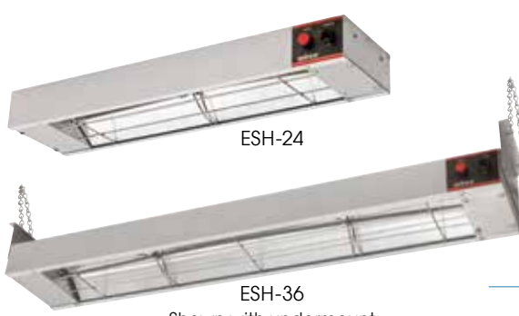
Shown with undermount bracket and hanging chain