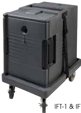
IFT-1 & IFT-1D