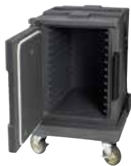
INTERIOR VIEW IFT-1