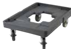
IFT-1D (INCLUDES STRAP) Can also be used with IFPC-series