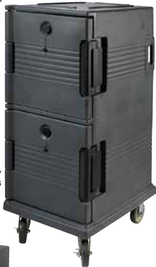
IFT-2 Built-in dolly with casters