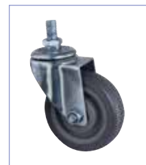
SRK-CT 4" caster