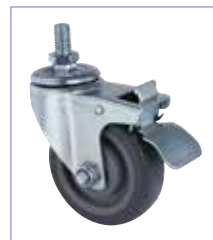
SRK-CTB 4" caster with brake