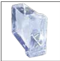
WXDXH (IN.) 3/8 x 7/8 x 7/8