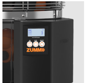
Higher juice extraction speed