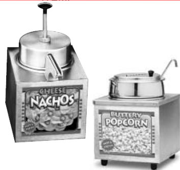
Model: Nacho Cheese Pump and Hot Butter Warmer