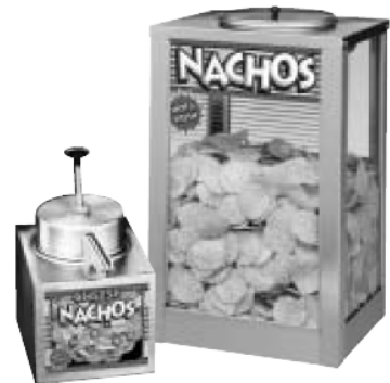
Nacho Cheese Pump with Nacho Cabinet