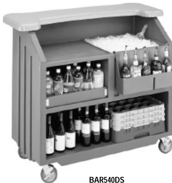
BAR540DS (Shown with 5-bottle Speed Rail)