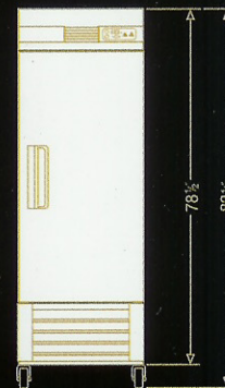
BASR1 / BASF1