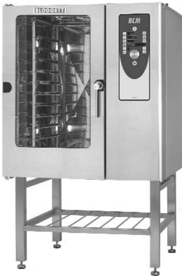
Shown on optional stand with shelf and adjustable feet