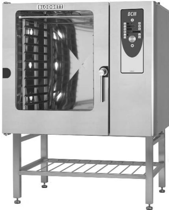
Shown on optional stand with shelf and adjustable feet