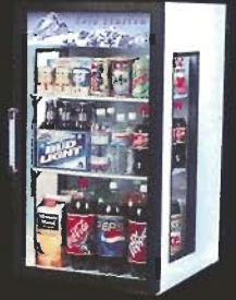
EGR 7 Display Refrigerator