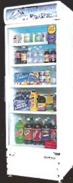
EGR 14 Display Refrigerator