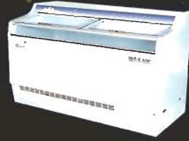
EGF 13 / EGF 9 Ice Cream Freezer