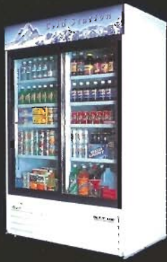
EGR 48 Display Refrigerator