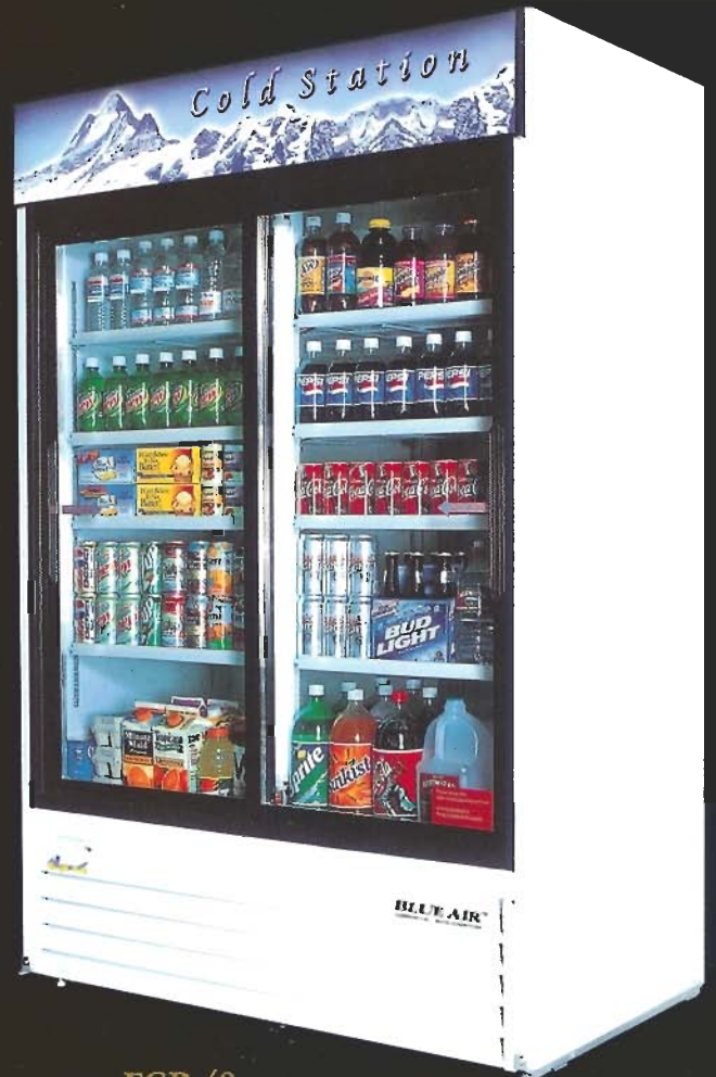
EGR 48 Display Refrigerator