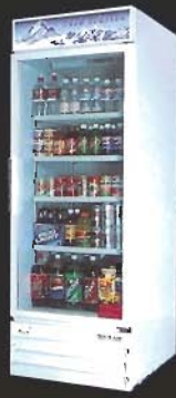
EGR 24 Display Refrigerator