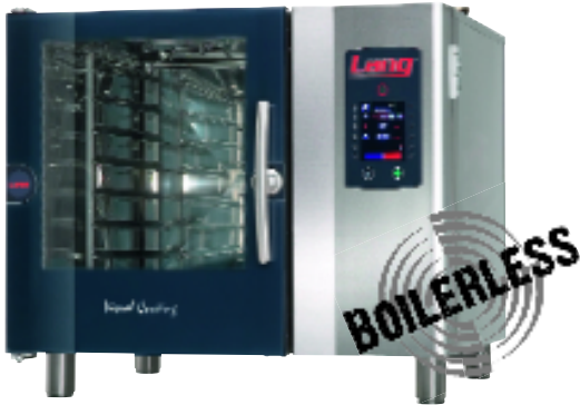
Model CPE1.06 shown (counter model)