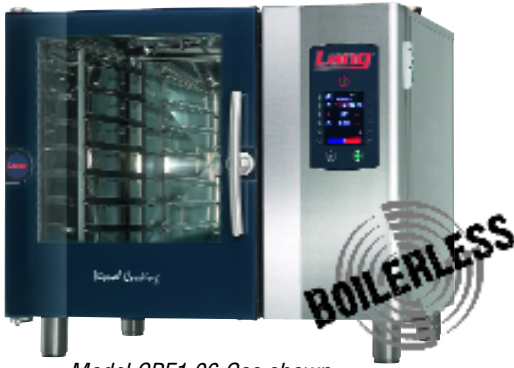
Model CPE1.06 Gas shown (counter model)