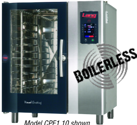
Model CPE1.10 shown (counter model)