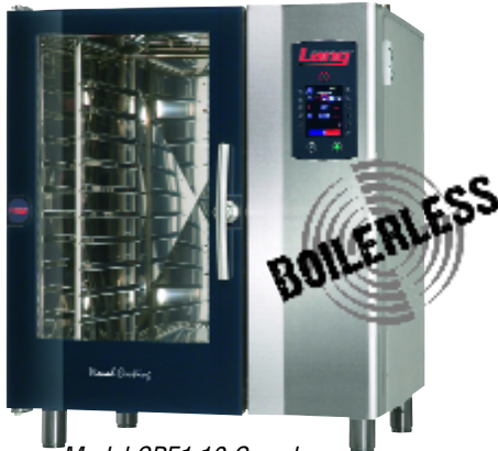
Model CPE1.10 Gas shown (counter model)