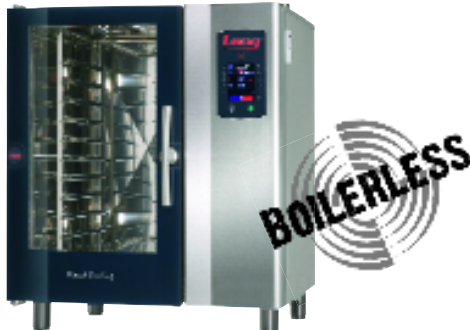
Model CPE2.06 shown (counter model)