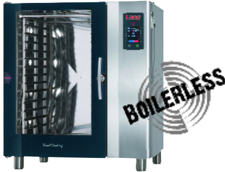
Model CPE2.14 gas shown (counter model)