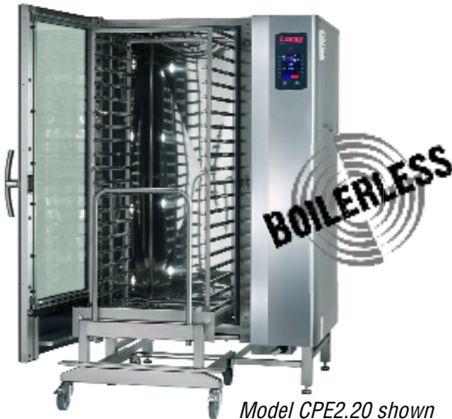
Model CPE2.20 shown