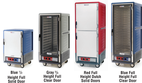
Blue ½ Height Full Solid Door