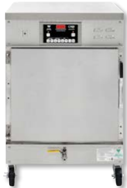
CAC509 CVAP® COOK & HOLD OVEN HALF SIZE MODEL WITH FAN 8000 Series Electronic Controls

CVap equipment complies with domestic and international requirements such as UL, C-UL, UL Sanitation, CE, MEA, and others.