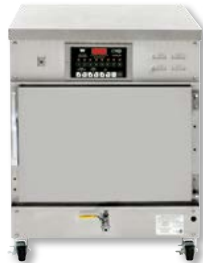
CAT507 CVAP® THERMALIZER OVEN HALF SIZE MODEL WITH FAN 8000 Series, 8 - Channel Electronic Control

CVap equipment complies with domestic and international requirements such as UL, C-UL, UL Sanitation, CE, MEA, and others.