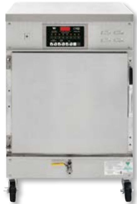
CAT509 CVAP® THERMALIZER OVEN HALF SIZE MODEL WITH FAN

CVap equipment complies with domestic and international requirements such as UL, C-UL, UL Sanitation, CE, MEA, and others.