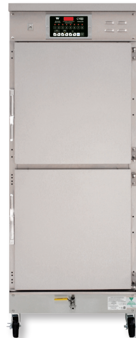
CAT522 CVAP® THERMALIZER OVEN

CVap equipment complies with domestic and international requirements such as UL, C-UL, UL Sanitation, CE, MEA, and others.