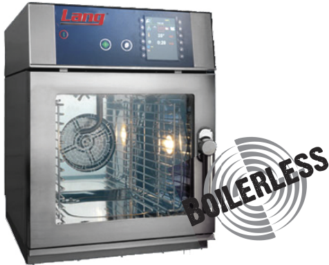
Model CSCPE1.06 shown (counter model)