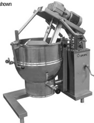
Model DHT-40, INA/2 shown

charged with water and rust inhibitors to ensure long life and minimum maintenance.