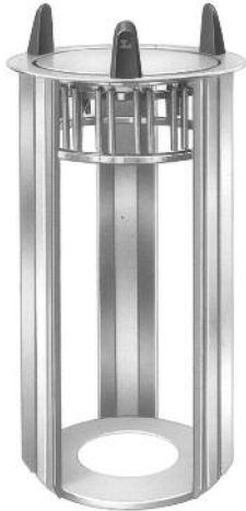
Model 400925 Open