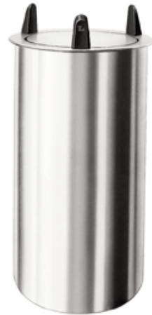
Model 500925 Shielded