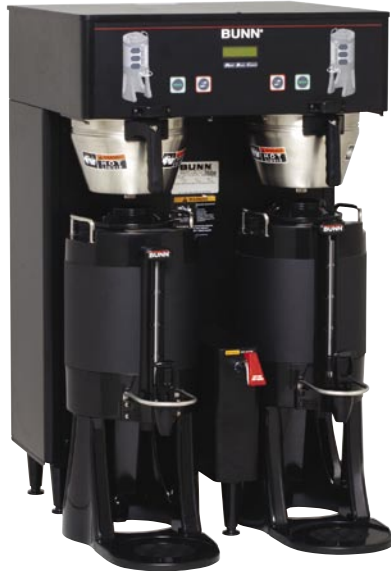
Model Dual TF DBC with 1.5 gallon TF Servers* (servers sold separately) Dimensions: 35.7" H x 21.8" W x 20.2" D (90.7cm H x 55.4cm W x 51.3cm D)