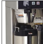
Stainless steel decor available.

For current specification sheets and other information, go to www.bunn.com .