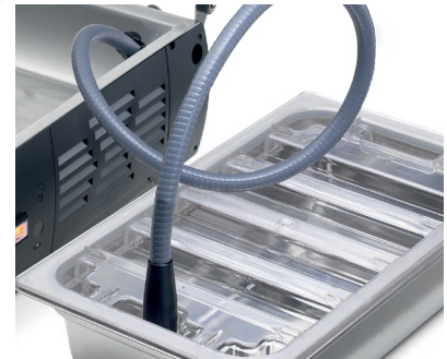
External Vacuum Hose

Optional: Reinforced gastronorm containers and lids External vacuum hose, to be used with gastronorm containers and lids