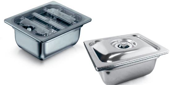
Reinforced Gastronorm Containers and s/steel Lids