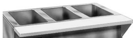
Richlite® heat-resistant cutting board