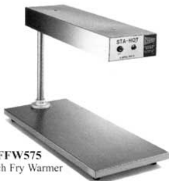
FFW575 French Fry Warmer

When customers come to your store or restaurant, two things are certain: they want their food hot and they want it to taste fresh.