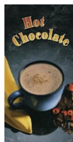
Model FMD-1 available with optional Hot Chocolate Display